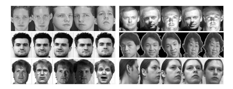
Fig. 2. Some face samples from the compound database. Left: 1st row from ORL, 2nd row from Bern, 3rd row from Yale; Right: 1st row from Harvard, 2nd row from Asian, 3rd row from UMIST.

A compound database with 1654 face images of 157 objects or classes is used to assess the performance of the proposed CSC and HCF schemes. The compound face database is composed of the following six databases: (1) The ORL database containing 40 distinct persons with 10 images per person. The images are taken at different times, with varying lighting conditions, facial expressions and facial details (glasses/no-glasses). All persons are in the up-right, frontal position, with tolerance for some side movement. (2) The Bern database containing frontal views of 30 persons, each person having 10 images with slight variations in the head positions, specifically two images right into the camera, two